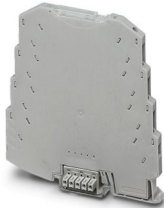
DIN rail housing, Complete housing, tall design, with TBUS option, with screw connection, width: 6.3 mm, height: 93.1 mm, depth: 101.2 mm, color: light gray (similar RAL 7035), cross connection: DIN rail bus connector (optional)

Please be informed that the data shown in this PDF document is generated from our online catalog. Please find the complete data in the user documentation. Our general terms of use for downloads are valid.