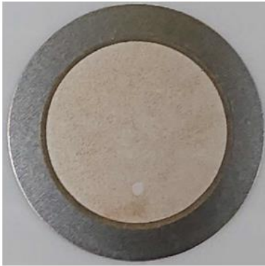
Example of electrode sulfidation